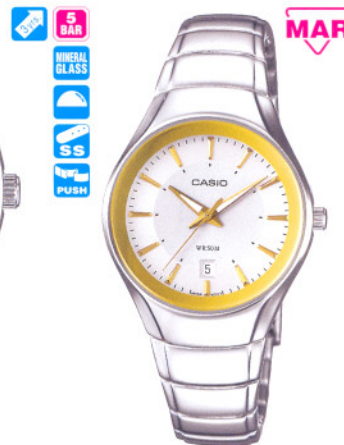
LTP-1325D-7A2VDF 2718 © Stainless steel