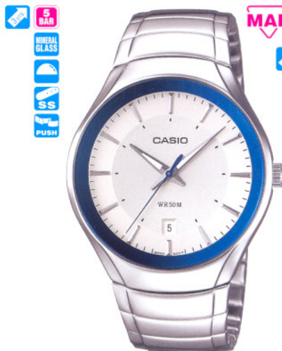
MTP-1325D-7A1VDF 5180 © Stainless steel