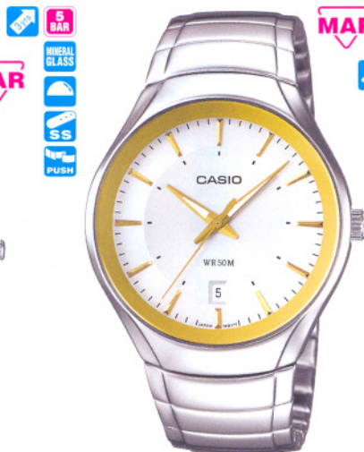
MTP-1325D-7A2VDF 5180 © Stainless steel