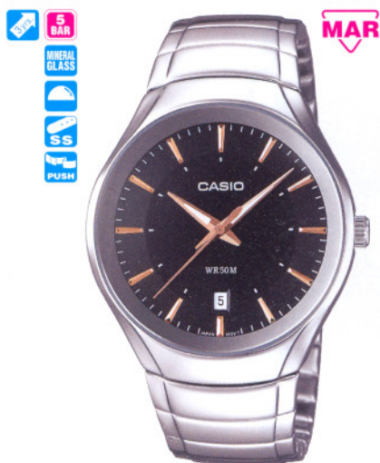
MTP-1325D-1AVDF 5180 © Stainless steel