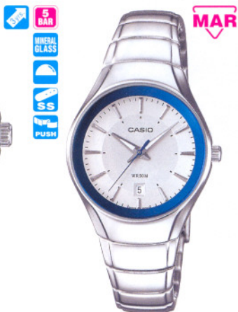
LTP-1325D-7A1VDF 2718 © Stainless steel